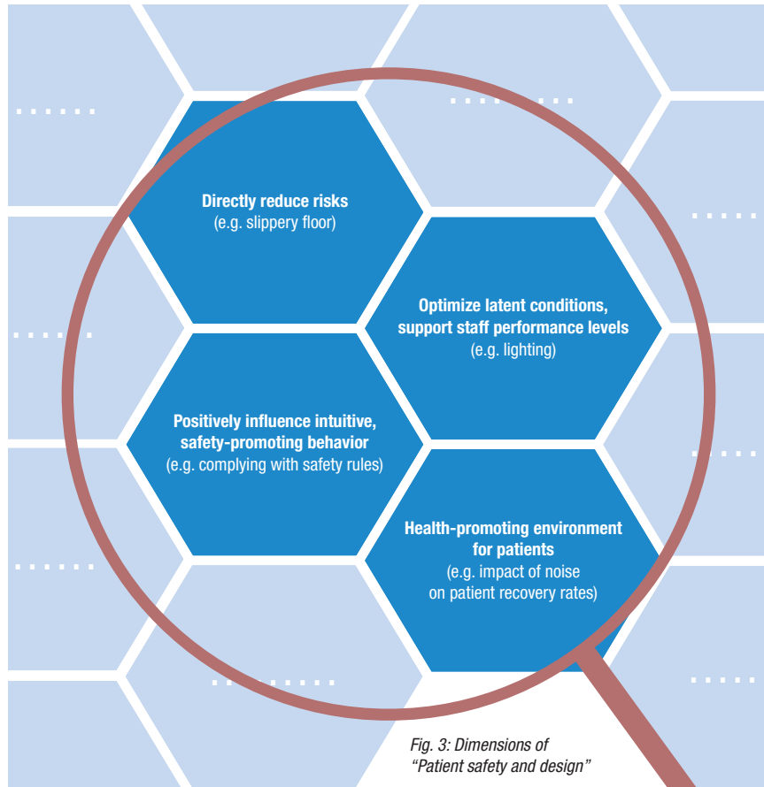
Fig. 3: Dimensions of "Patient safety and design"